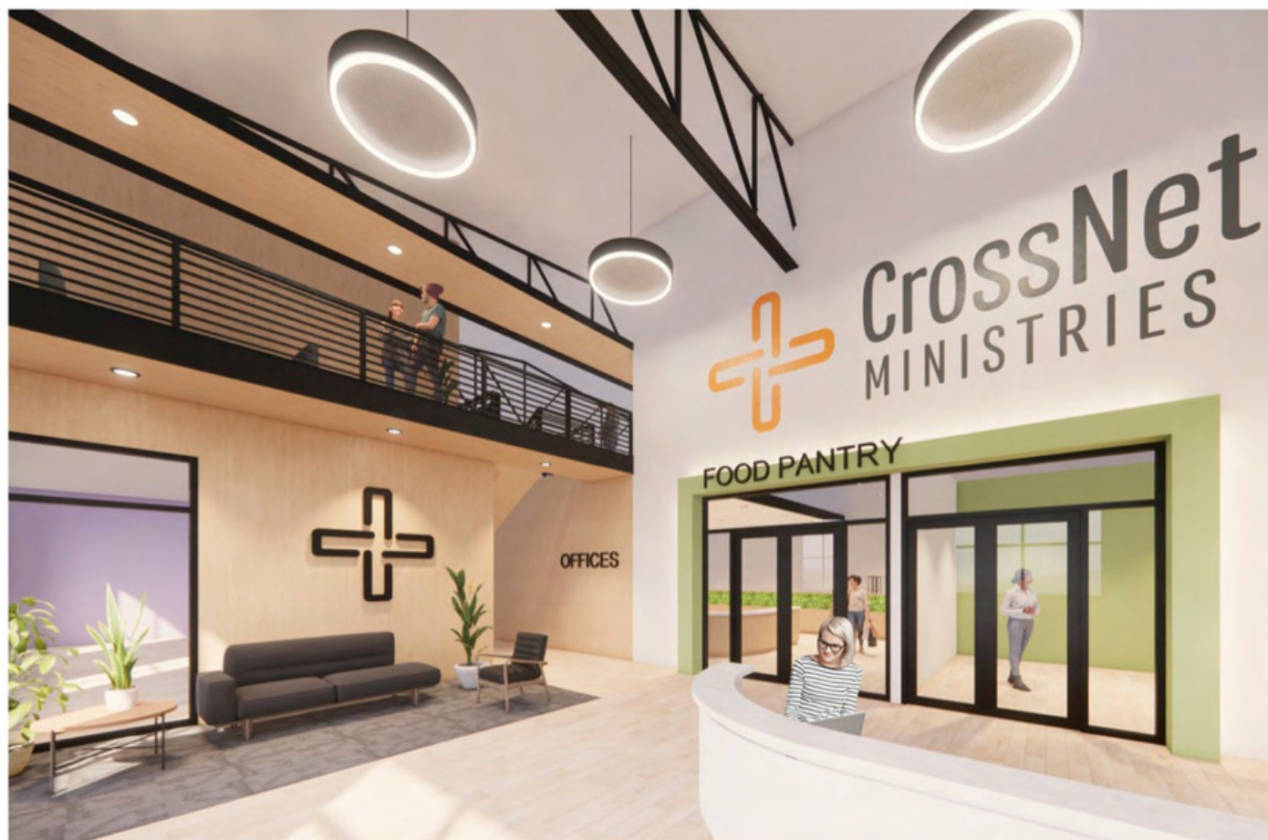
MAIN ENTRY LOBBY AREA