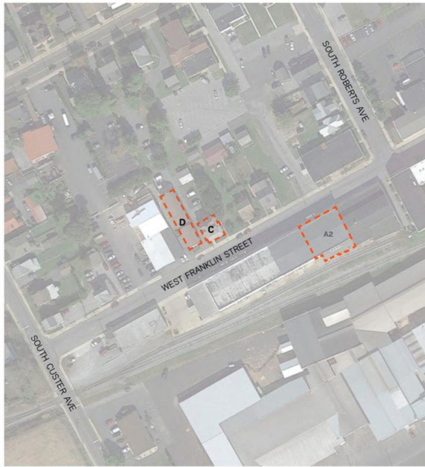
WEST FRANKLIN STREET OVERVIEW PLAN // EXISTING