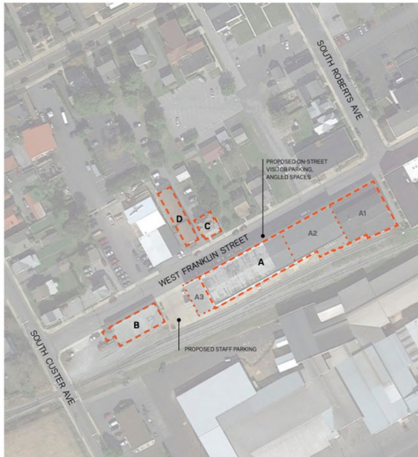
WEST FRANKLIN STREET OVERVIEW PLAN // PROPOSED