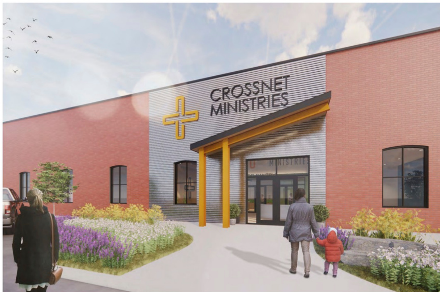
FRONT ENTRY [WEST FRANKLIN STREET]